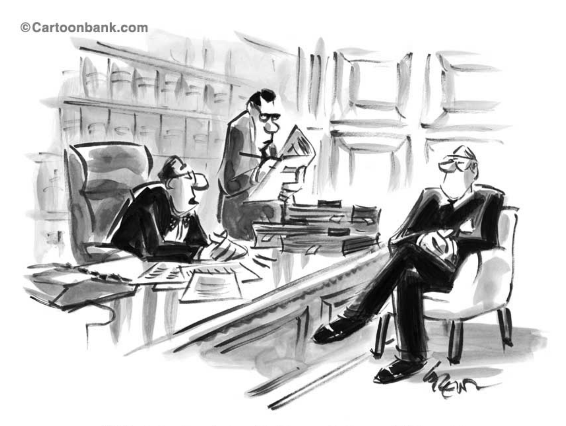
"O.K.—let's review what you didn't know and when you didn't know it."