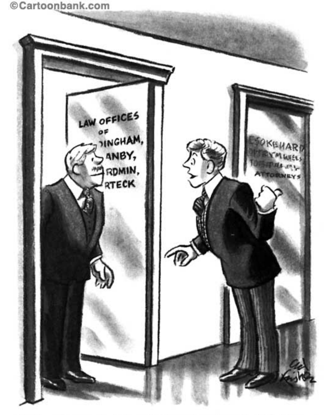
"I'm from Simmersby, Blomm & Tuggarton, down the hall. Can you spare us a few dense paragraphs of legal boilerplate?"